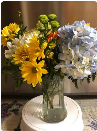
Extended Reutimann Family